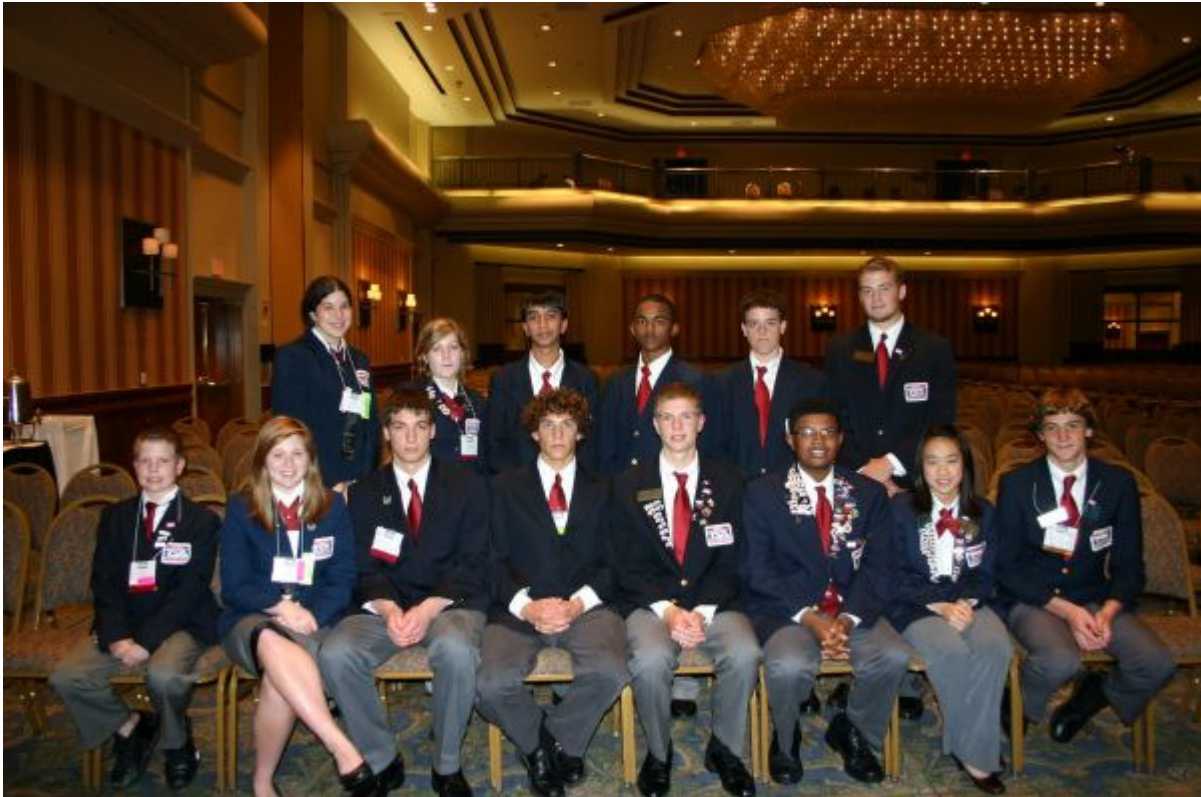
2009-2010 Virginia TSA Executive Council

The Virginia Association of the Technology Student Association Welcomes you to...