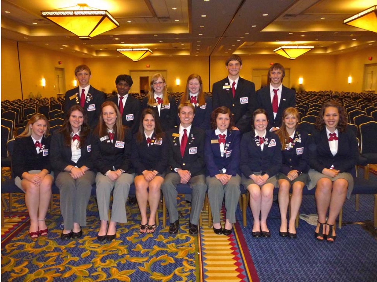
2011-2012 Virginia TSA Executive Council

The Virginia Association of the Technology Student Association Welcomes you to...